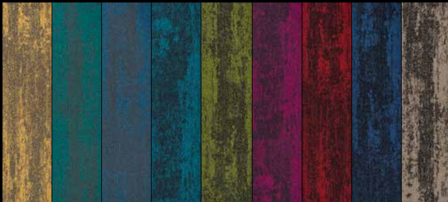
COMPOUND ZINC YELLOW 6-082-003PL COMPOUND ZINC TEAL 6-046-021PL COMPOUND ZINC AZURE 6-040-036PL COMPOUND LEAD AQUA 2-021-031PL COMPOUND LEAD GREEN 2-048-002PL COMPOUND LEAD MAGENTA 2-060-062PL COMPOUND CARBON RED 1-023-035PL COMPOUND CARBON NAVY 1-019-040PL COMPOUND CARBON SAND 1-007-099PL

construction yarn/fibre pile weight pile height gauge tile size total thickness carton size total weight dimensional stability backing electrostatic propensity fire rating ISO 9239 1 recommended adhesive installation method