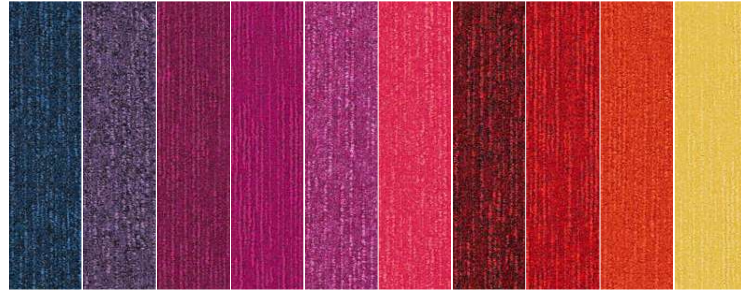
NORSE MATHIAS 019PL NORSE FREYA 033PL NORSE ERIKA 060PL NORSE INGRID 107PL NORSE BRITTA 106PL NORSE INGE 022PL NORSE LENA 023PL NORSE AME 035PL NORSE GRETA 054PL NORSE KARI 082PL