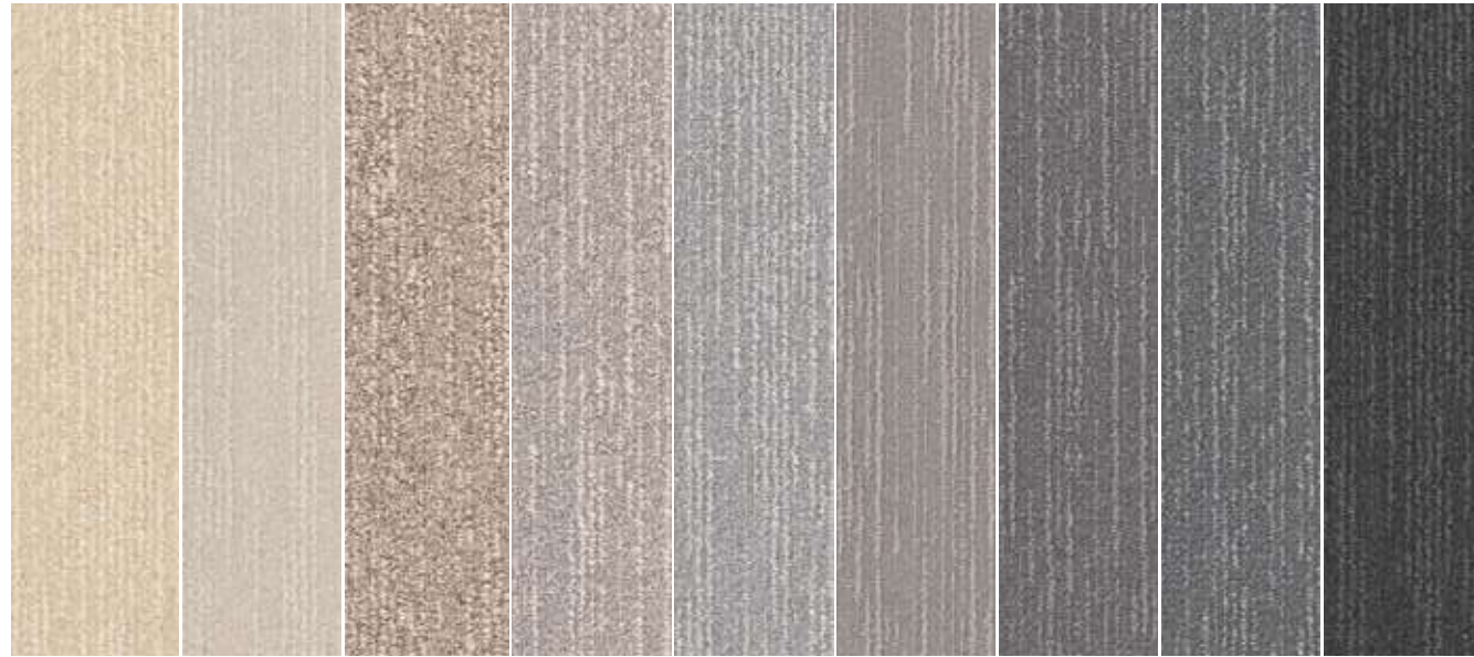
NORSE RAE 900PL NORSE SOREN 800PL NORSE LUND 700PL NORSE LARZ 600PL NORSE STEN 500PL NORSE ESKEL 400PL NORSE OSKAR 300PL NORSE JAX 200PL NORSE DYLAN 100PL