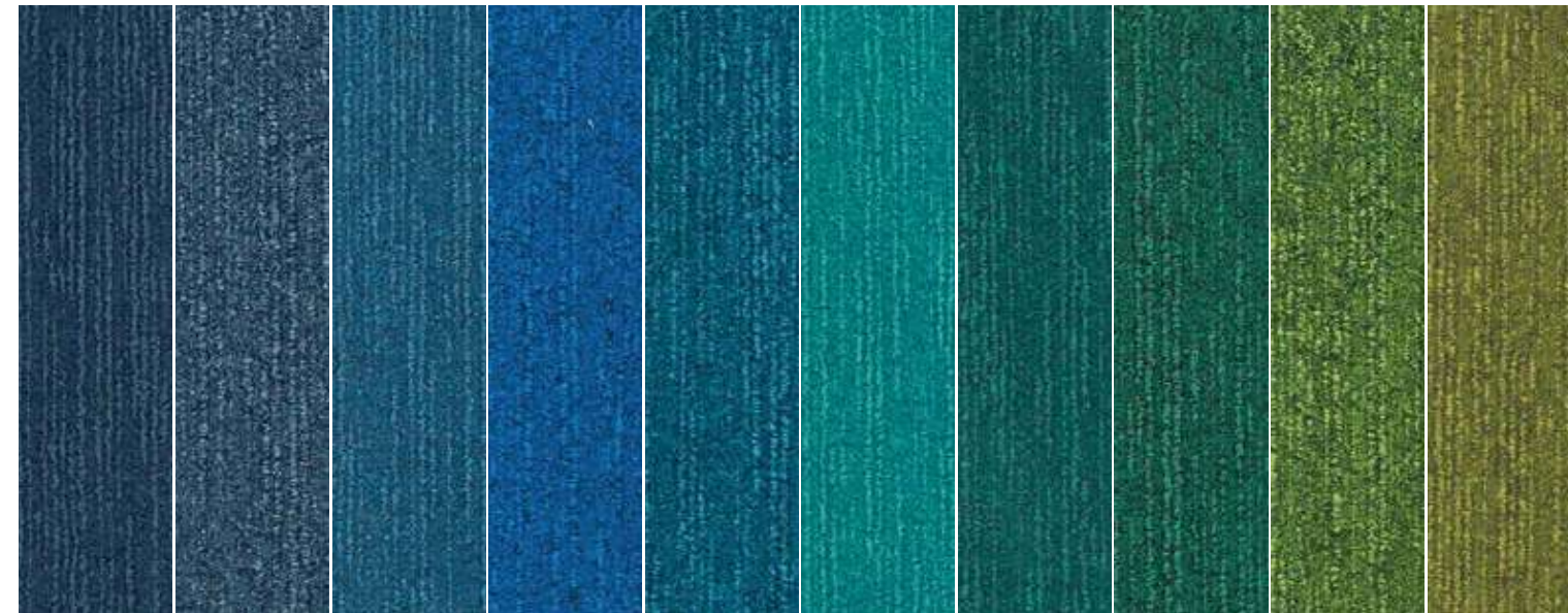
NORSE ROLF 067PL NORSE JAKOB 108PL NORSE BERGEN 105PL NORSE AAREN 004PL NORSE OLAF 071PL NORSE HENRIK 104PL NORSE TAIT 102PL NORSE HALDEN 103PL NORSE LEIF 045PL NORSE NILSEN 002PL