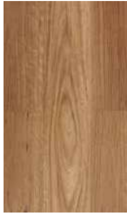
New England Blackbutt