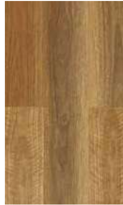
NSW Spotted Gum