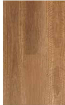
QLD Spotted Gum