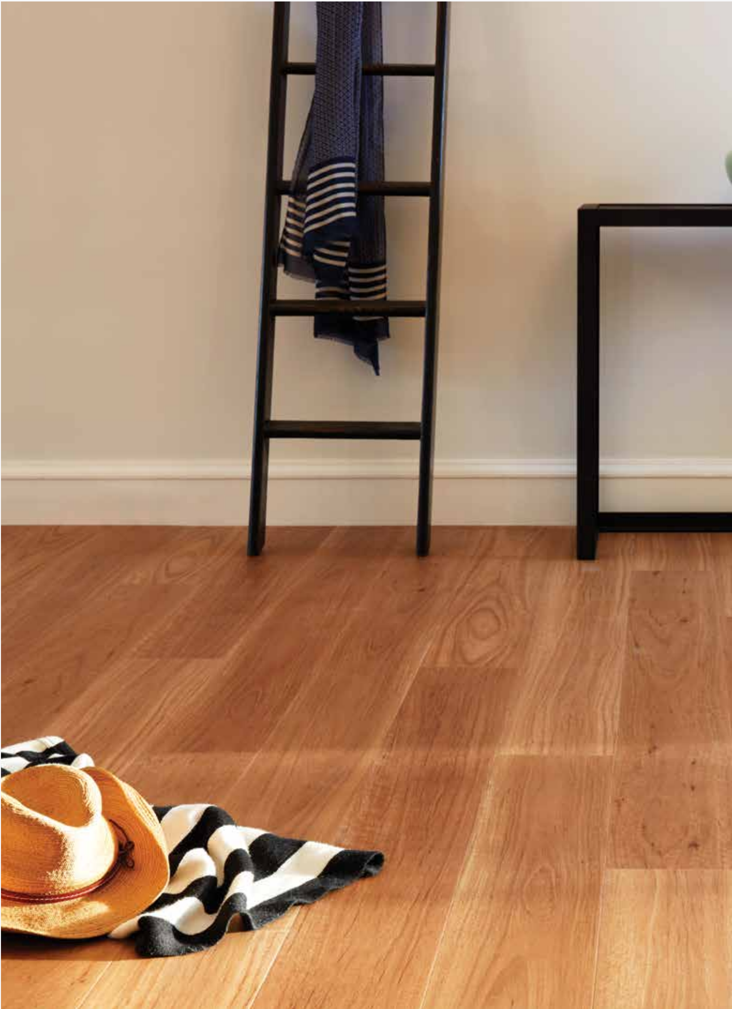
Front Cover Colour: Pale Gorge