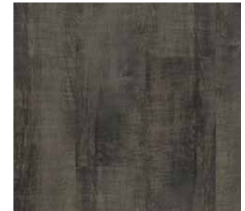
Tiger Oak EMP123815TC