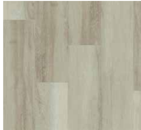
Breeze Oak EMP642107TC WOODMIX