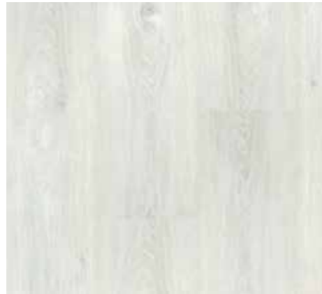
Ice Oak EMP1313110TC