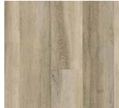
Swiss Oak EMP642109TC WOODMIX