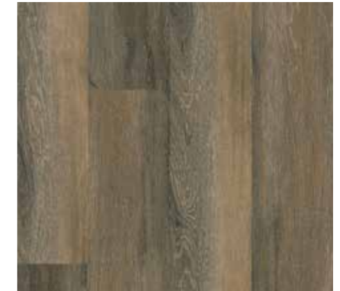
Coffee Oak EMP642105TC WOODMIX