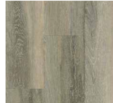
Raven Oak EMP642102TC WOODMIX