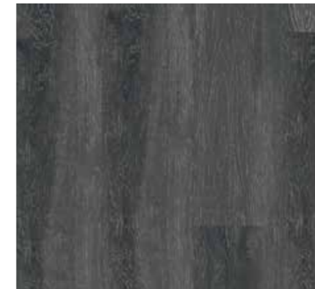
Ebony Oak EMP642112TC WOODMIX