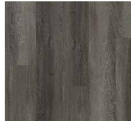
Mocha Oak EMP642111TC WOODMIX