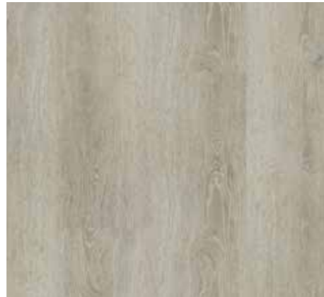
Frappe Oak EMP131312TC