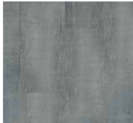
Earl Oak EMP123812TC