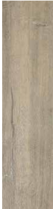
Paperbark Oak CIT4914TC