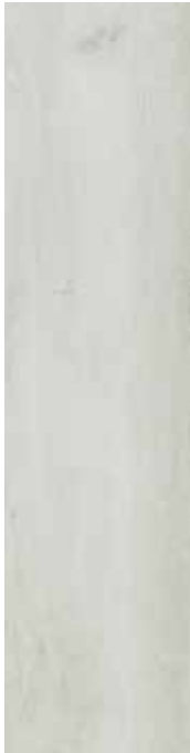
Snow Oak CIT4912TC