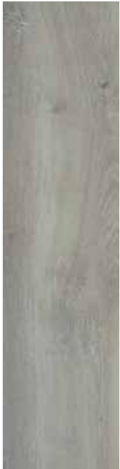
Nimbus Oak CIT4911TC