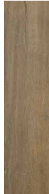
Honeycomb Oak CIT4918TC