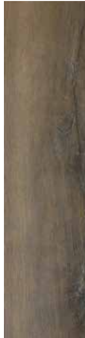
Village Oak CIT4915TC