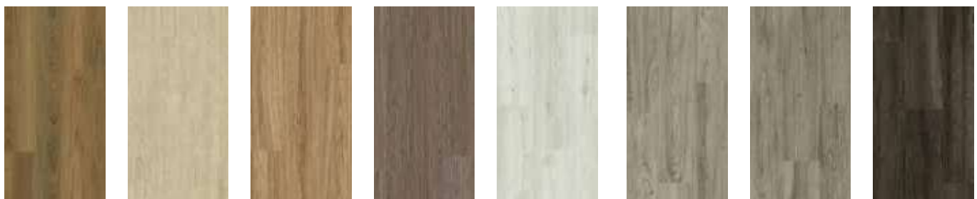
555 Colonial Spotted Gum 560 High Street 625 Marble Arch 640 Fleet Street 710 Lancaster 730 Notting Hill 750 Kensington 780 Oxford