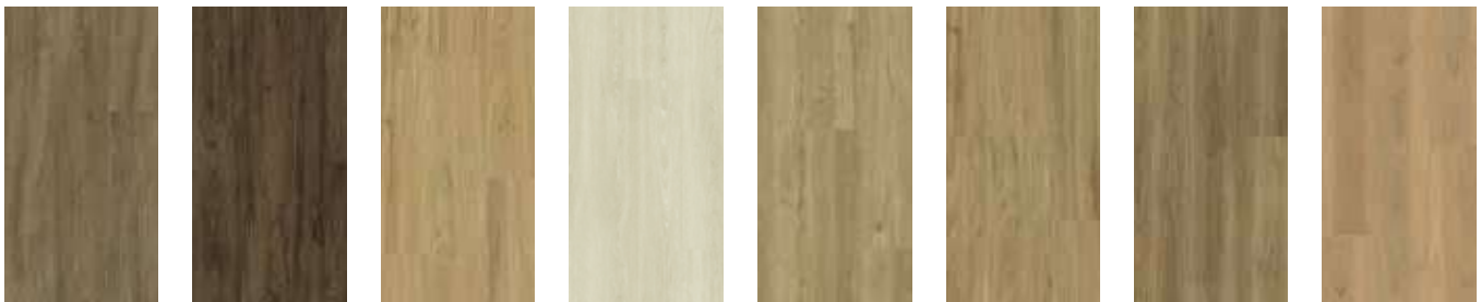
180 Mayfair 185 Camden 350 Paddington 510 Westminster 520 Park Lane 530 St James 540 Imperial 545 Colonial Blackbutt